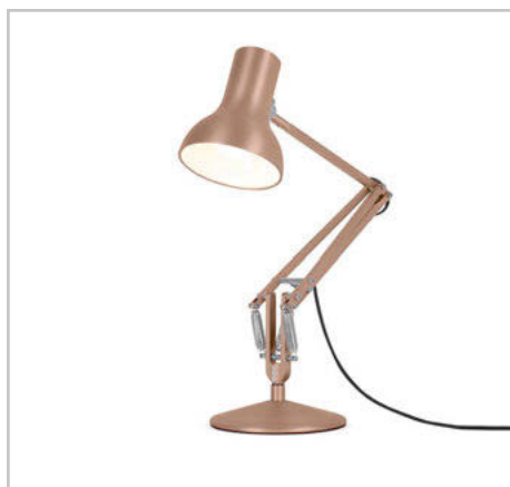
Type 75 Mini Metallo Anglepoise

With 38,000sqm of exhibition space and 450 industry leading exhibitors, half of which are foreign, the international lighting exhibition - now in its 29 th edition - is recognised as the global benchmark lighting exhibition, where technological innovation and design culture take centre stage. The array of goods encompasses products for outdoor, indoor and industrial lighting to lighting for shows and events, hospital lighting and special use lighting, home automation and lighting systems, light sources and lighting application software. Euroluce stands as an avantgarde trade fair in the field of eco-sustainability and energy saving in both the decorative and architectural lighting technology sectors. www.salonemilano.it