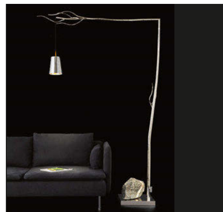
Flintstone Brand Van Egmond

Barovier & Toso's Swing ceiling lamp features parts that can change its position depending on the vision of the client, giving rise to ever changing combinations and lighting scenarios. Like all Barovier & Toso collections, it can be made to measure and thus suitable for use in interiors and for large dramatic installations. www.barovier.com