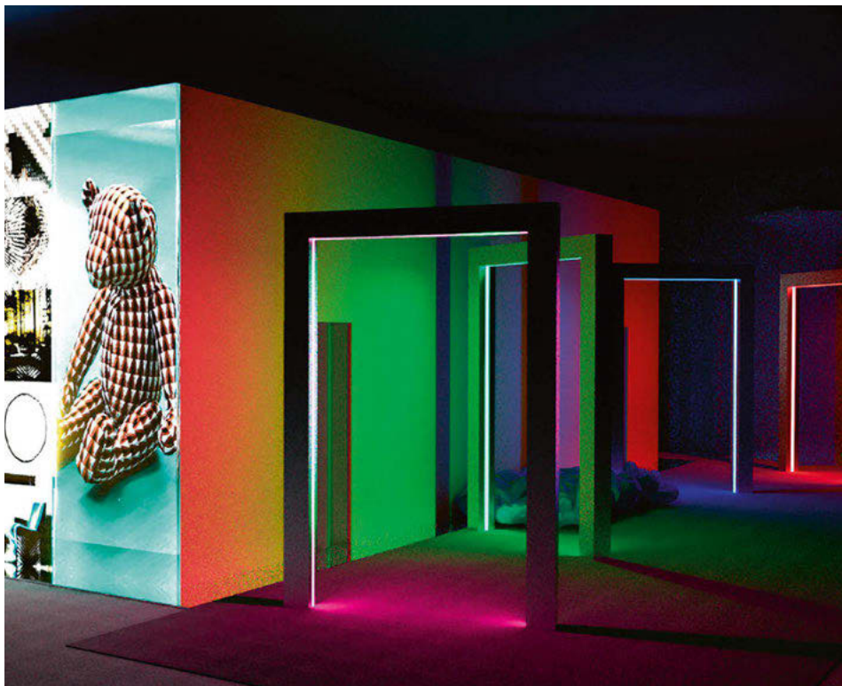
Euroluce Salone del Mobile

With 38,000sqm of exhibition space and 450 industry leading exhibitors, half of which are foreign, the international lighting exhibition - now in its 29 th edition - is recognised as the global benchmark lighting exhibition, where technological innovation and design culture take centre stage. The array of goods encompasses products for outdoor, indoor and industrial lighting to lighting for shows and events, hospital lighting and special use lighting, home automation and lighting systems, light sources and lighting application software. Euroluce stands as an avantgarde trade fair in the field of eco-sustainability and energy saving in both the decorative and architectural lighting technology sectors. www.salonemilano.it